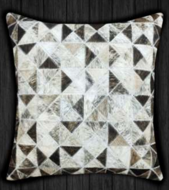
NIRVANA - EXOTIC