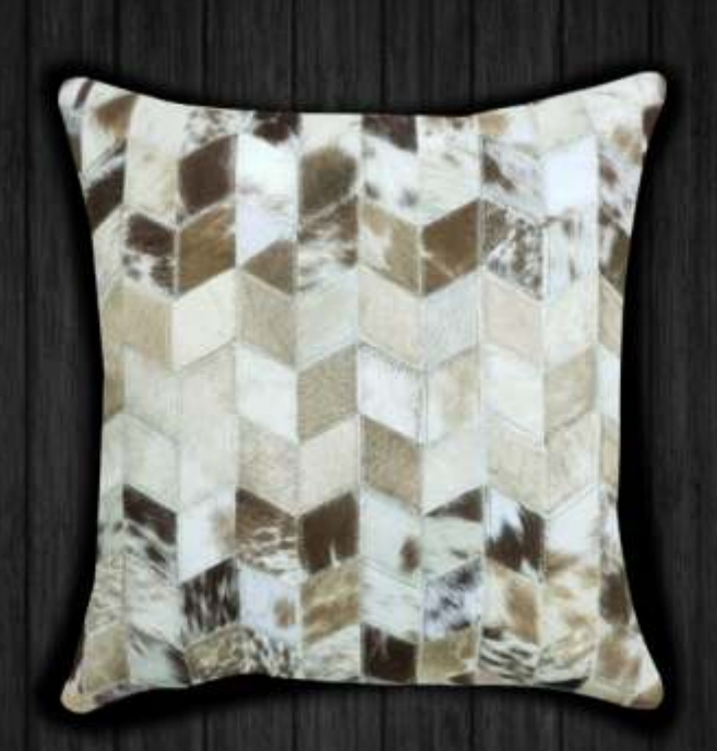
CHEVRON - EXOTIC